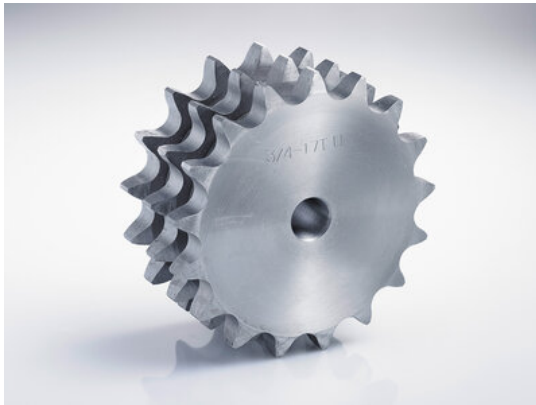
plate wheel 08B-3 20 teeth

Part no.: 81005463 Packaging Unit: 1pce Model: 20 teeth