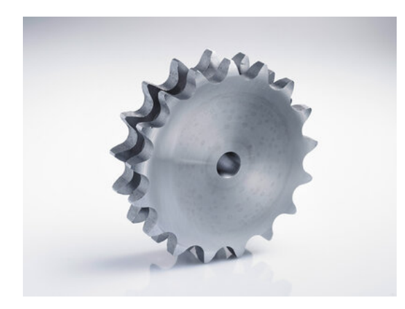
plate wheel 10B-2 13 teeth