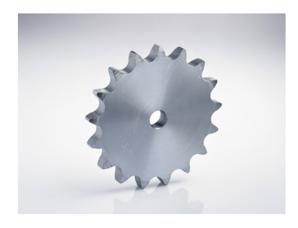
plate wheel 20B-1 42 teeth