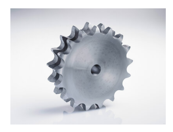
plate wheel 20B-2 19 teeth