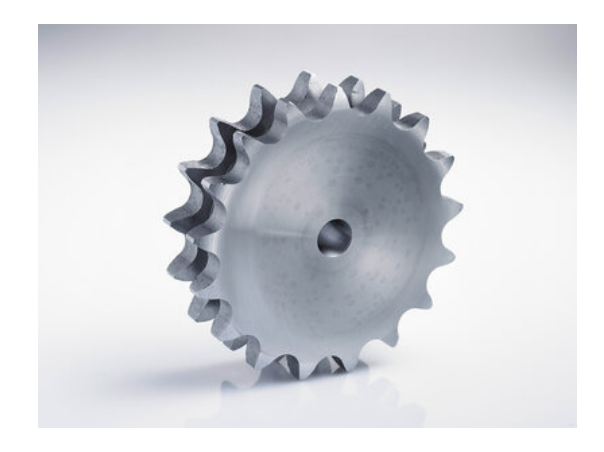
plate wheel 05B-2 29 teeth

Part no.: I452877b84e50 Packaging Unit: 1pce