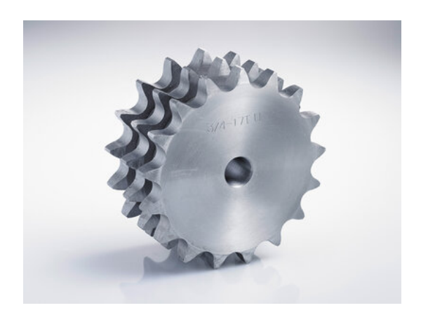
plate wheel 10B-3 13 teeth

Part no.: I28b11beb1113 Packaging Unit: 1pce