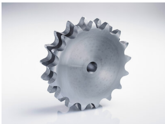
plate wheel 20B-2 42 teeth