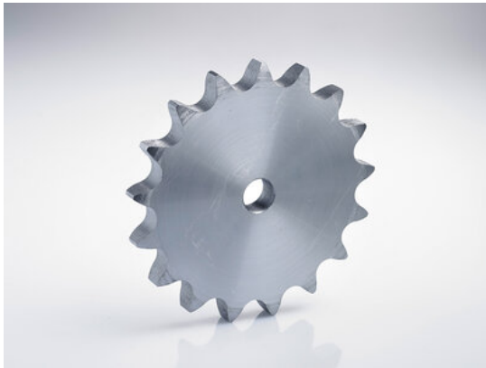
plate wheel 24B-1 42 teeth