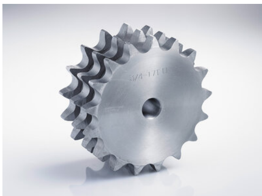
plate wheel 24B-3 32 teeth